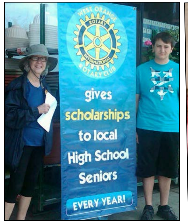
West Orange Rotary Club Food DriveInteractor